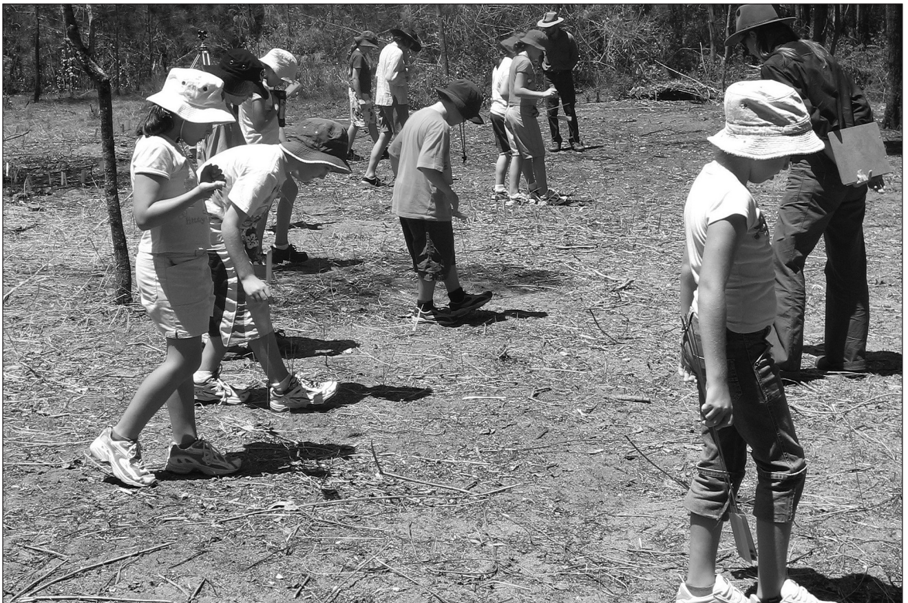
Figure 3 Students from Gympie West State School survey a grid square for surface artefacts at Mill Point.

archaeological project, a Year 6 class from Gympie West State School was selected to take part in the pilot program.