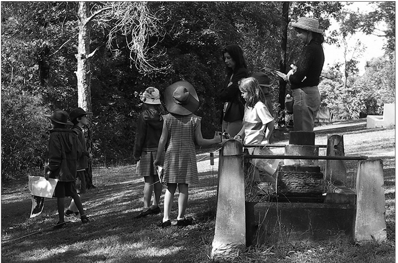
Figure 2 Students and teachers from Toowong State School surveying in the Toowong Cemetery (Photograph: Catherine Westcott).

The activity was run in the morning over a period of 2.5 hours, which ensured the children were not tired out (the cemetery tours involved walking across sometimes steep terrain) and their enthusiasm levels and concentration were maintained. Positive feedback was received from the teachers accompanying the students, the archaeologists involved, and the students themselves, as well as the local government councillor who came by to observe the